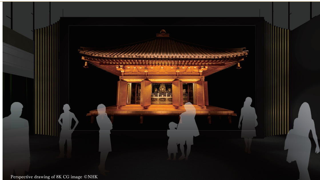
Perspective drawing of 8K CG image