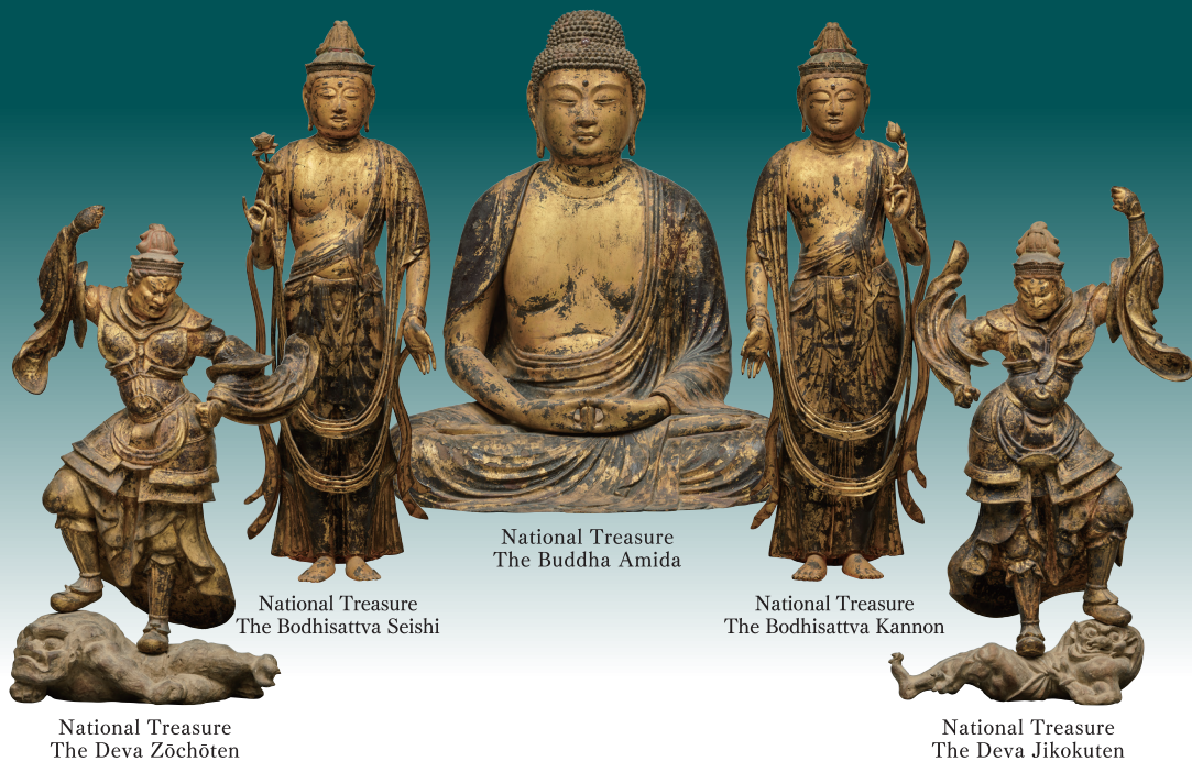
National Treasure The Buddha Amida