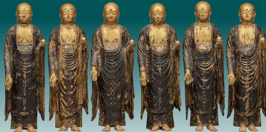
National Treasure Six Emanations of the Bodhisattva Jizō

This special exhibition marks nine centuries since the Golden Hall of Chūson-ji Temple was built in 1124. The exhibition will feature the hall's glittering adornments and National Treasures, including the eleven Buddhist statues enshrined on its central altar and a celebrated temple ornament with legendary birdlike creatures ( kalavinka ). Additionally, in a groundbreaking first, a full-scale digital recreation of the Golden Hall in ultra-high-definition 8K will also be on view in the gallery, immersing visitors in the luminescent golden atmosphere that has inspired prayer and devotion for 900 years. The exhibition is also a unique chance to discover the outstanding cultural masterpieces of the historic town of Hiraizumi, which was recognized as an official UNESCO site in 2011.