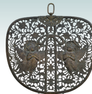
National Treasure "Flower Garland" Ornament with Kalavinka