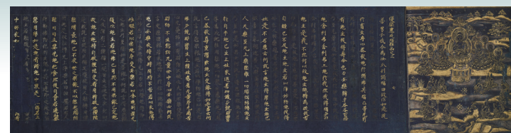
National Treasure The Chūson-ji Canon Gold and silver ink on indigo-dyed paper *Subject to rotations during the exhibition period

All works are National Treasures dating to the 12th century (Heian period) and are owned by the Konjiki-in of Chūson-ji Temple in Iwate Prefecture.